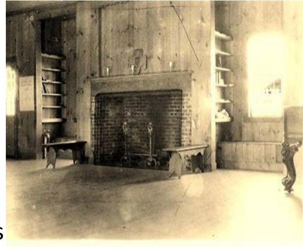
Hingham GS House Circa 1929

3. Create a mascot for Girl Scouts and draw or create your mascot. Think about who you would you want to be representing Girl Scouts. What qualities would your mascot have? Vote with your troop on which mascot displays the meaning of Girl Scouts best and whose is the most creative.